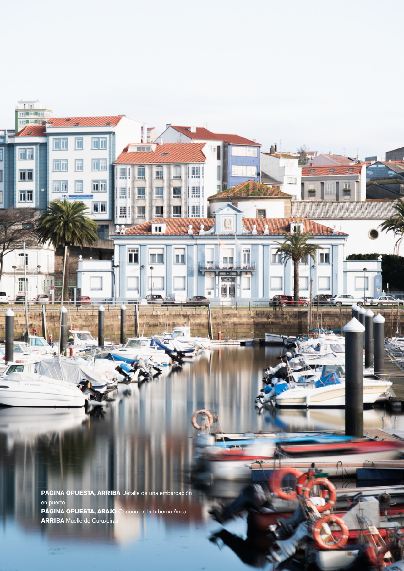
PÁGINA OPUESTA, ARRIBA Detalle de una embarcación en puerto