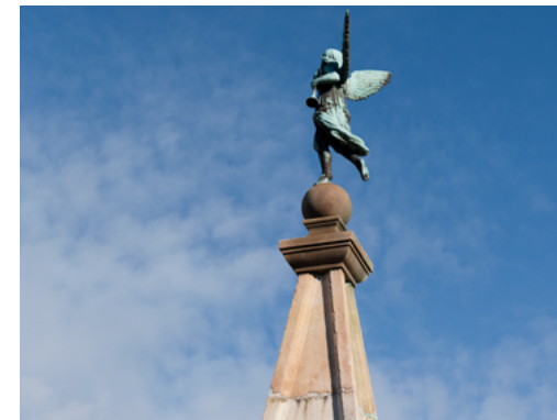
ABOVE Gate of Arsenal Militar park BELOW Fountain of La Fama

No. 40 is home to the La Cubana dry-cleaners, a family business where the managers are third-generation dry-cleaners and experts in cleaning all types of garments, from