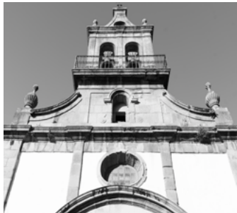
B Iglesia del Socorro