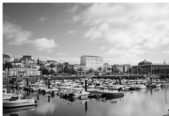
A Paseo da Mariña