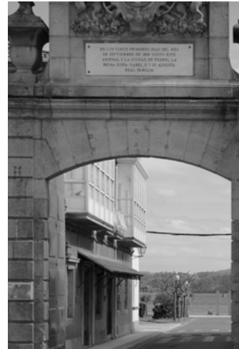
E Puerta del Parque del Arsenal