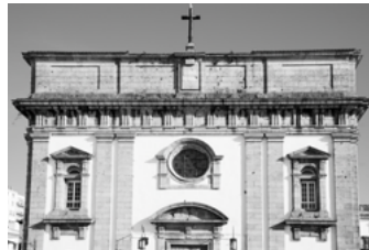
C Iglesia de San Francisco