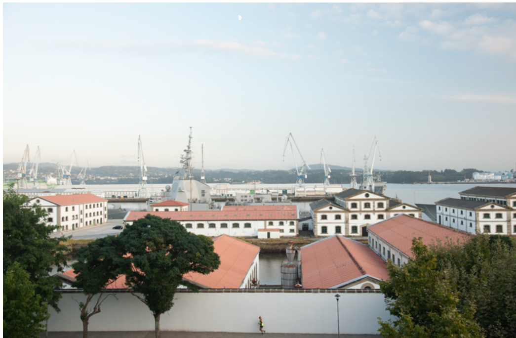
ABOVE Iglesia de San Francisco BELOW View from Jardines de Herrera

then continue along this street and, like us, head towards rúa Benito Vicetto 4.